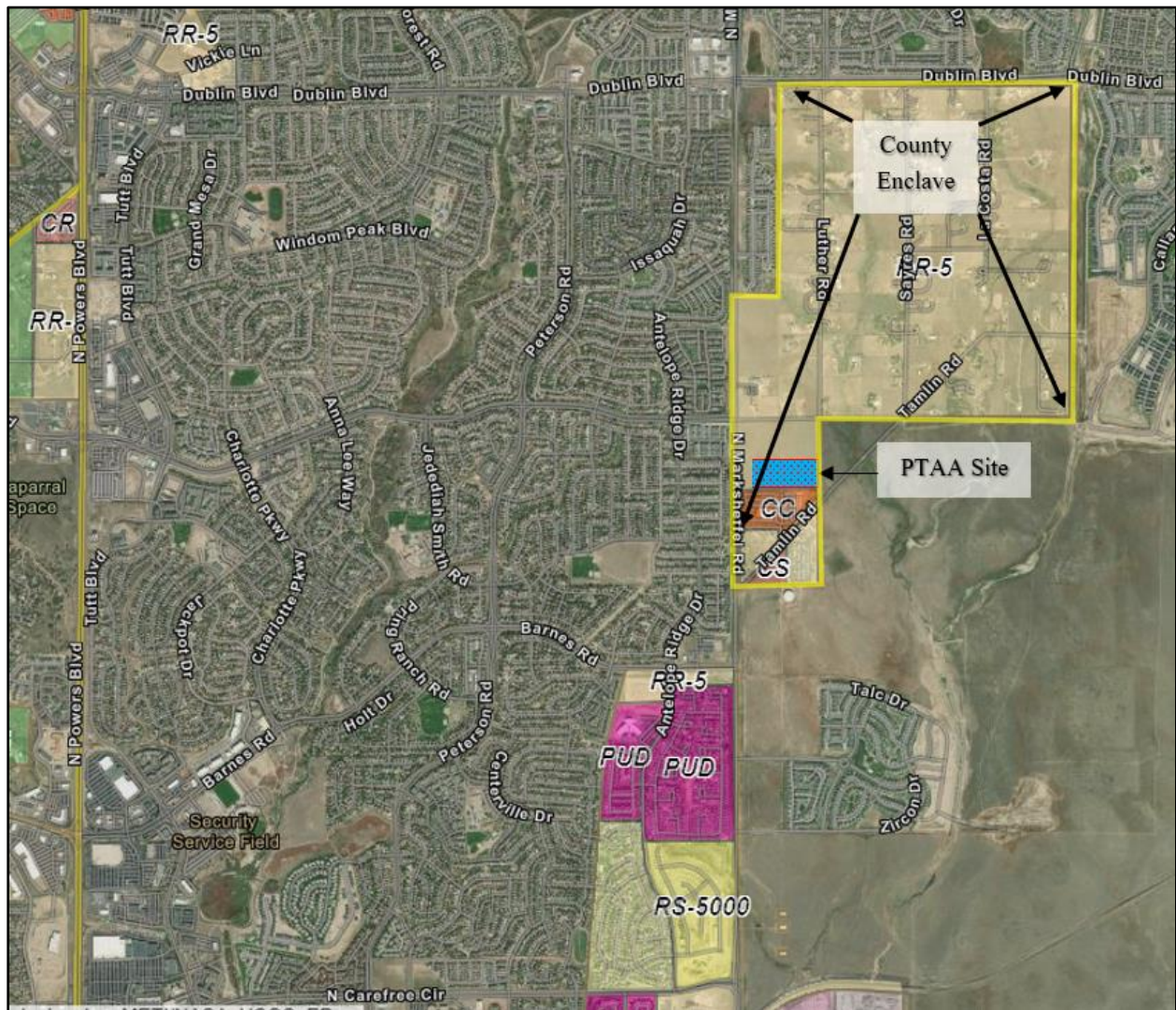
Exhibit 2. Map of the PTAA site (Project Site) and overall El Paso County Enclave

Proposed access into the site is via Tamlin Road at the southeast corner of the site and proposed access leaving the site is via a right-out only access on Marksheffel Road at the southwest corner of the site.