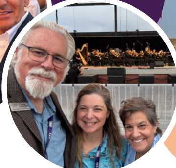
Councilmember Mike O'Malley hosts a townhall in District 6 regarding public safety at a neighborhood park in July of 2024.