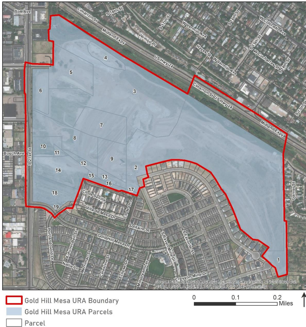
Figure 1. Gold Hill Mesa Commercial URA Boundary

The Gold Hill Mesa Commercial Urban Renewal Area (“URA” or “Plan Area”) is located in the City of Colorado Springs in El Paso County. The Plan Area is comprised of 19 parcels on approximately 106.7 acres of land plus adjacent right-of-way (ROW). The boundaries of the Plan Area to which this Plan applies includes Highway 24 to the northeast, South 21 st Street to the west, and existing Villa De Mesa and Gold Hill Mesa residential developments to the south as shown below in Figure 1 .