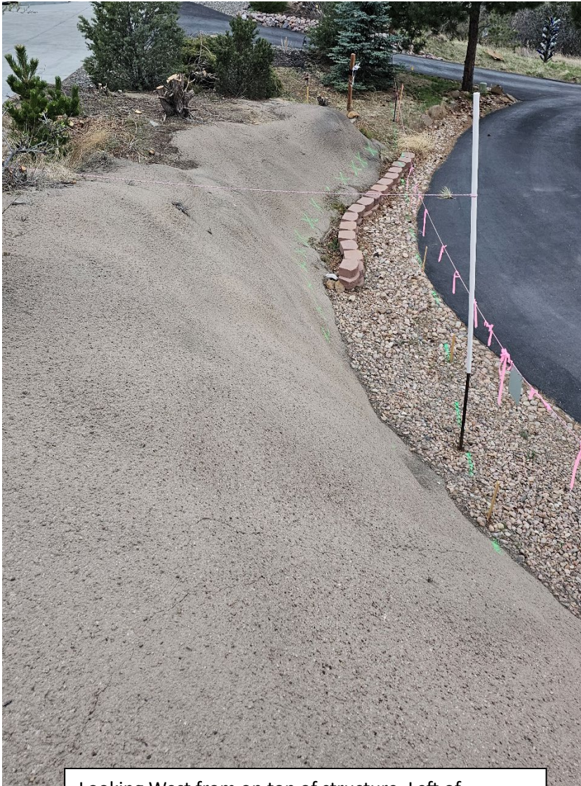
Looking West from on top of structure. Left of rope/fence property line is 1220 Eagle Rock (Fernandez) property