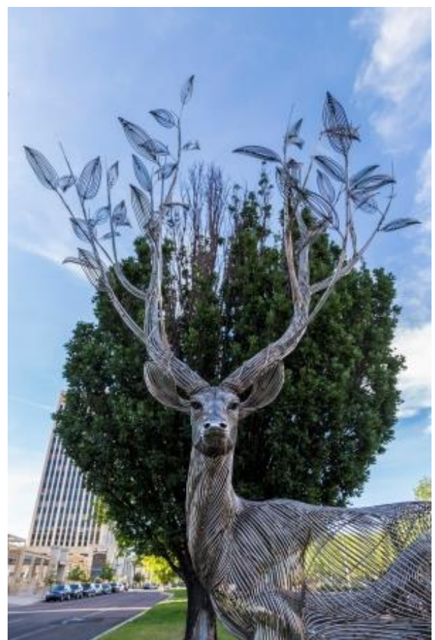
"I've Been Dreaming to Be a Tree" by Byeong Doo Moon at Cascade and Colorado Ave (Donated by Community Ventures, 2018)