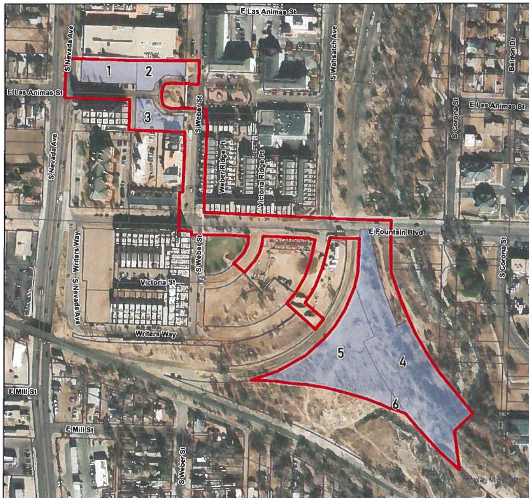
Figure 1. Bristow-Lowell Urban Renewal Plan Area

The Bristow-Lowell Urban Renewal Area ("URA" or "Plan Area") is located in the City of Colorado Springs in El Paso County. The Plan Area is comprised of six parcels on approximately 5.75 acres of land and the adjacent right of way (ROW). The boundaries of the Plan Area to which this Plan applies includes parcels 1 to 3 located along East Las Animas Street with South Weber Street to the east and South Nevada Avenue to the west; South Weber Street to East Fountain Boulevard; and parcels 4 to 6 located south of East Fountain Boulevard with South Corona Street to the east and South Weber Street to the west, as illustrated in red below in Figure 1 and more particularly described on Exhibit A attached hereto and made a part of hereof.