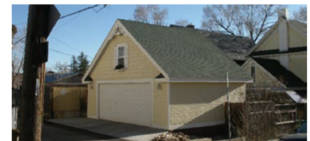
RECOMMEND new structures be designed to replicate forms of primary structures including roof pitch.