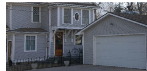
RECOMMEND using materials on garages and other accessory structures that match the primary structures.