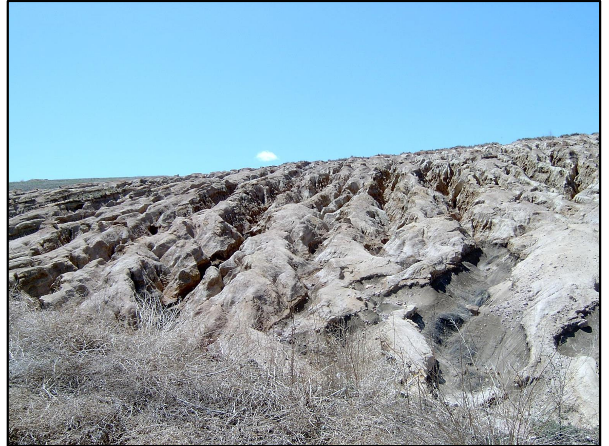
Eroding tailings at Gold Hill Mesa prior to cleanup

Current development process of the 210 acres site began in ~1995.