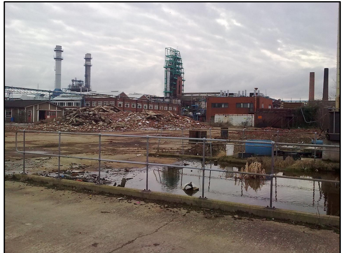
Industrial Brownfields Site

Legislatively authorized state program designed to facilitate cleanup and redevelopment of contaminated properties not subject to regulatory authority.