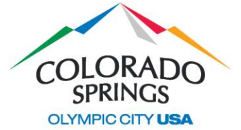
Cemetery Enterprise 2015-2025