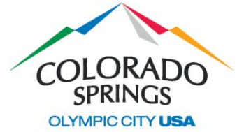
Cemetery Enterprise 2013-2023