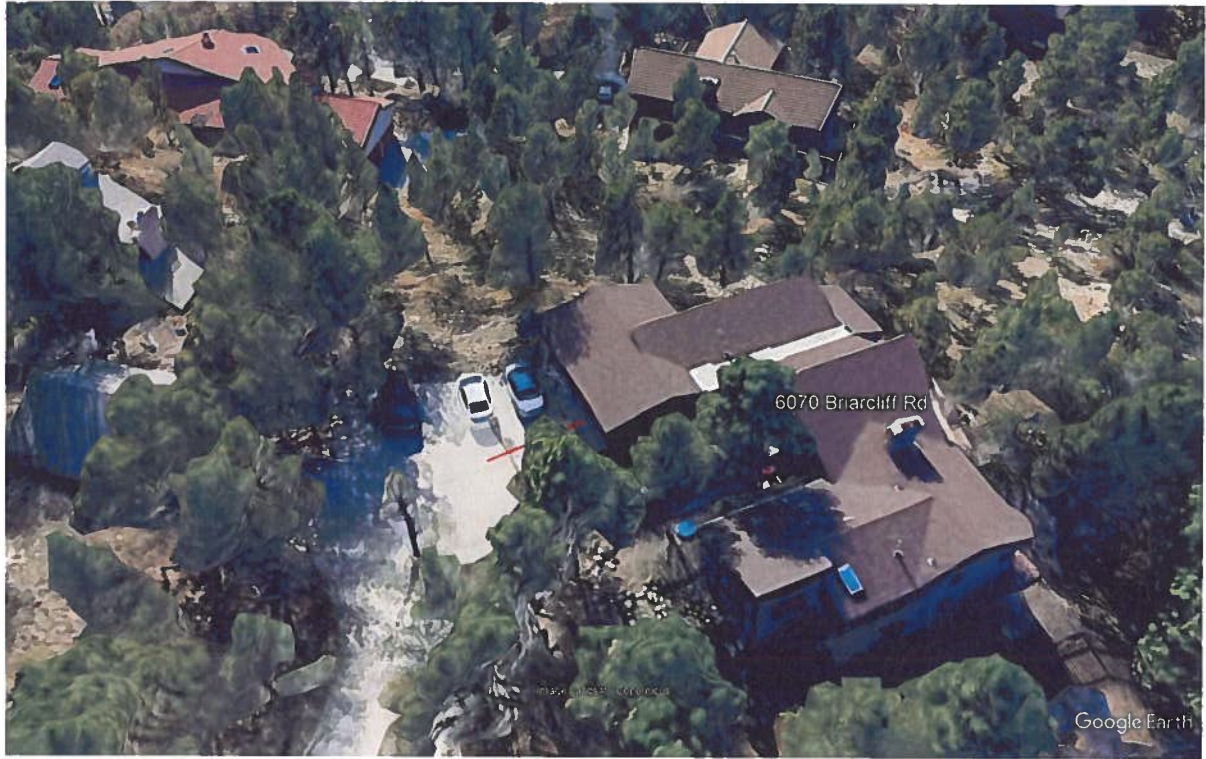
6060 garage is on the left, 6060 house upper left and red line in front of garage is 20 feet.