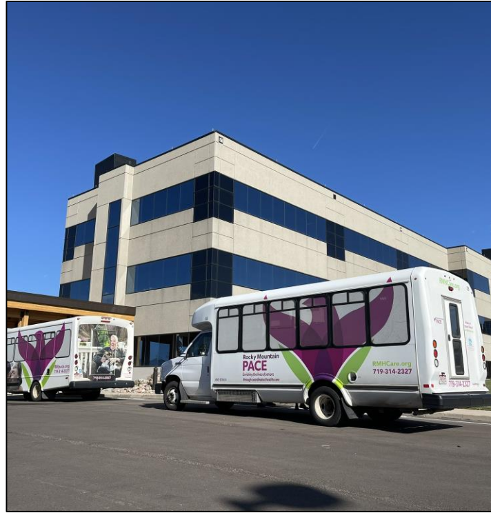
Rocky Mountain PACE at Explorer