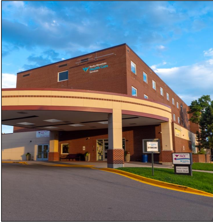
Rocky Mountain PACE at Pikes Peak