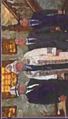
The City Council members at City Hall, Tuesday, where they participated in the 2023 Legislative Festival in America the Hills, with participation by Mayor, City Council President, and City Council members.