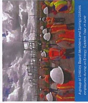
A group of Utilities Board Members and Springs Utilities employees during an Energy System Tour in June