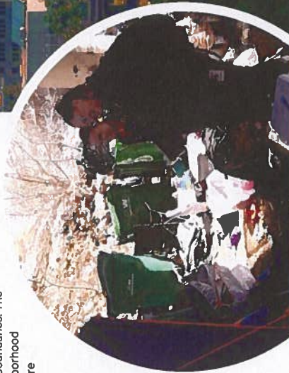
Colorado Springs Fire Department Homeless Outreach Program (HOP) team helping the homeless community in Colorado Springs.

After debate and consideration of amendments, the Resolution passed on a 8-0 vote.