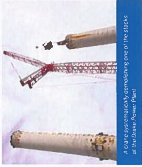
A crane systematically demolishes one of the stacks at the Drake Power Plant