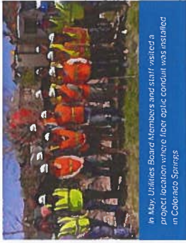
In May, Utilities Board Members and staff visited a project location where fiber optic conduit was installed in Colorado Springs

The reservoir, as well as some nearby trails, will remain closed to the public for safety reasons. The reservoir is expected to reopen to the public in 2026.