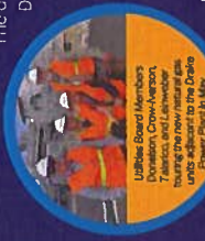
Utilities Board Members, Director, Crew-Work, Training, and Law-Work units gathered to see Drake Power Plant in May.

The demolition of the aging Drake Power Plant has started. The decision to close the plant was based on