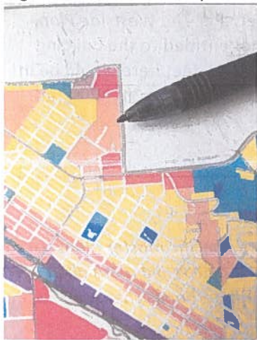
Figure 3: Zoom in of the applicant's land on the Generalized Land Use Map in The Westside Plan