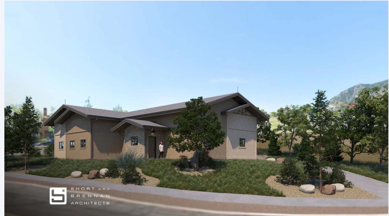
*Rendering of Future Star Ranch Pump Station (to be completed August 1, 2026)