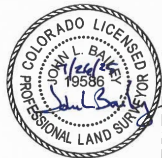
EXHIBIT "B" 2570.30-05 JULY 26, 2025 PAGE 3 OF 4