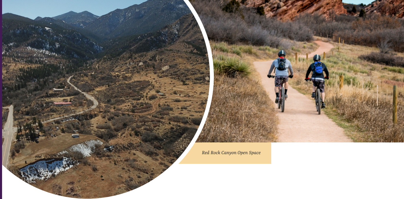
Red Rock Canyon Open Space