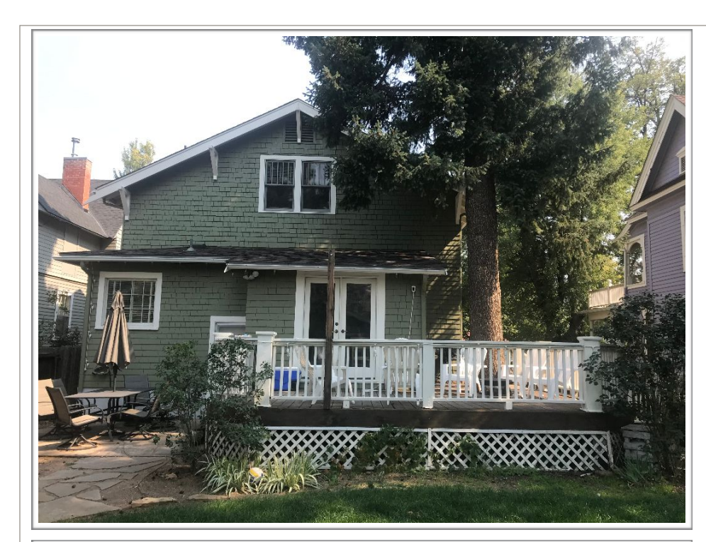
Existing rear facade with 1997 second story addition and 1991deck addition.