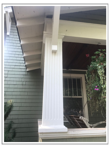
Colonial revival column detail.

Existing front facade with 1997 second story addition.