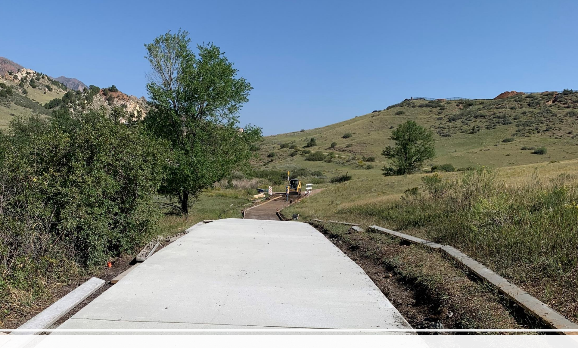
Palmer Mesa Trail-under construction