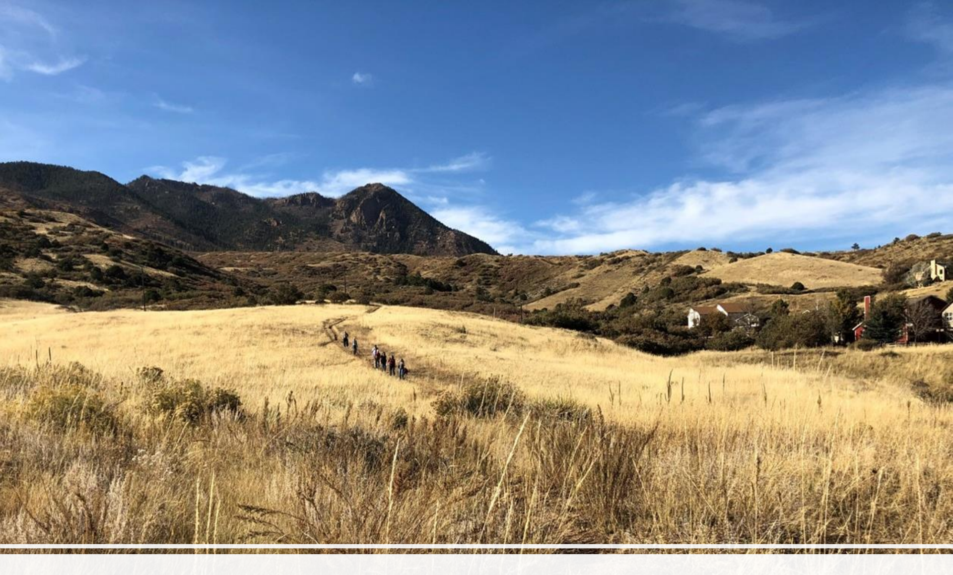
Pikeview Buffer Open Space