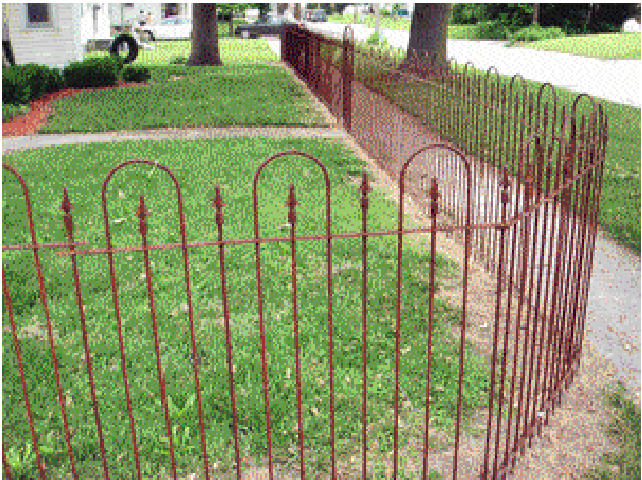
02 DESIGN OF FENCE N.T.S.

REQUIRED PARKING WILL BE OPERATING UNDER THE DRB-DP14-0008 GREEN MAN TAP ROOM 3-5-2014. WE ARE OPERATING UNDER THE TAP ROOM WARRANT.