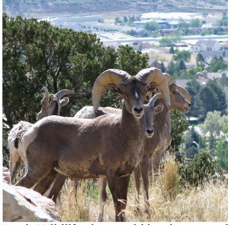
Iconic Wildlife that could be threatened