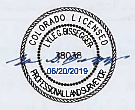
EXHIBIT B is attached hereto and is only intended to depict EXHIBIT A - Legal Description. In the event that EXHIBIT A contains an ambiguity, EXHIBIT B may be used to resolve said ambiguity.

Prepared for and on behalf of Galloway by Lyle G. Bissegger, PLS# 38038