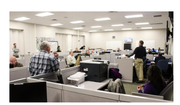
EPC OEM Coordination Center