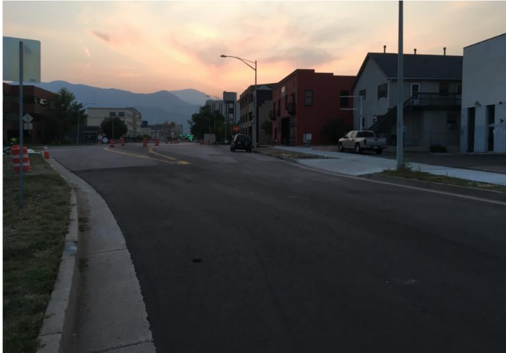
Figure 5. Street Parking after 5pm on weekdays and weekends.