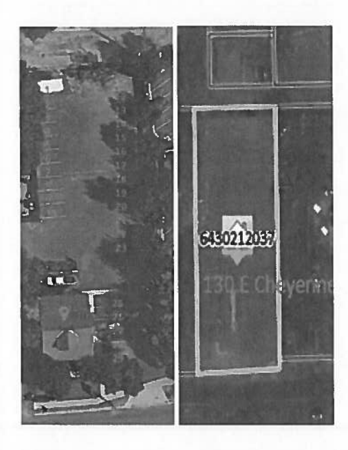
Objection 6) The proposed location of the Medical Marijuana Center is also within 1000 feet of Clinic 5280 at 1629 S Nevada Ave. This was not disclosed.

Objection 7) In Pure Medicals may have provided an invalid argument in the application for administrative relief, section 2, i. "relocating MMC is unable to find any conforming properties" when in-fact several buildings in the Southgate shopping area would suite well with very adequate parking, including those around the vacated Sears.