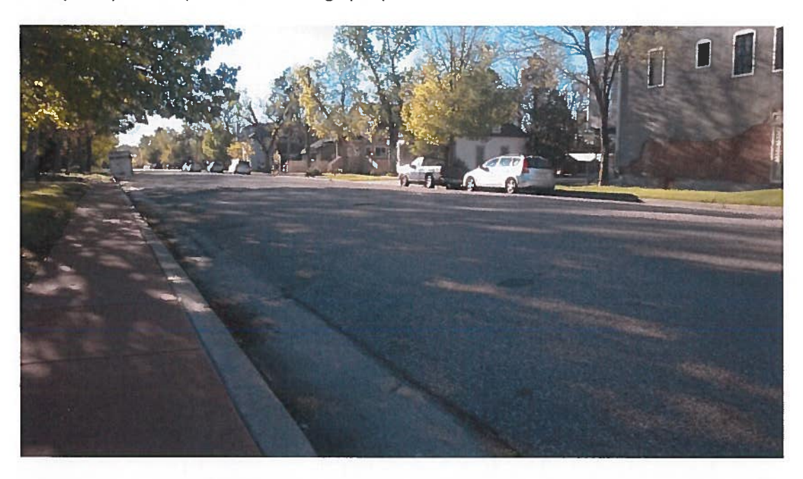
5/24/17 at approximately 3:30PM: most of the on-street stalls are occupied, but there are vacant stalls available on the north and south sides of the street on the block (roughly 4 or 5 vacant stalls total)

5/24/17 at approximately 7:30AM: roughly 25% of the on-street stalls are occupied; the north side of Dale is completely vacant (other than storage pod).