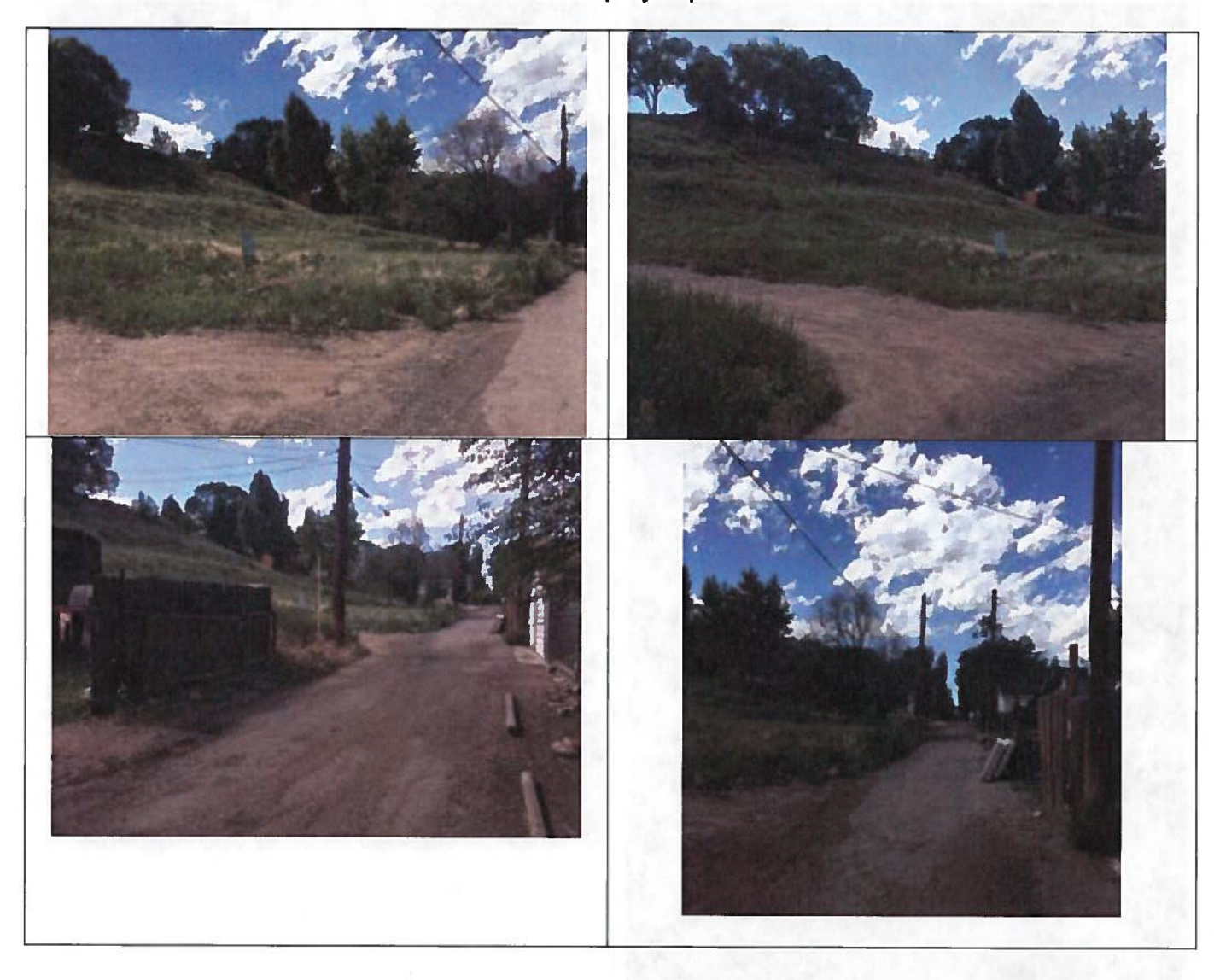
Attachment A: Property Slope Pictures