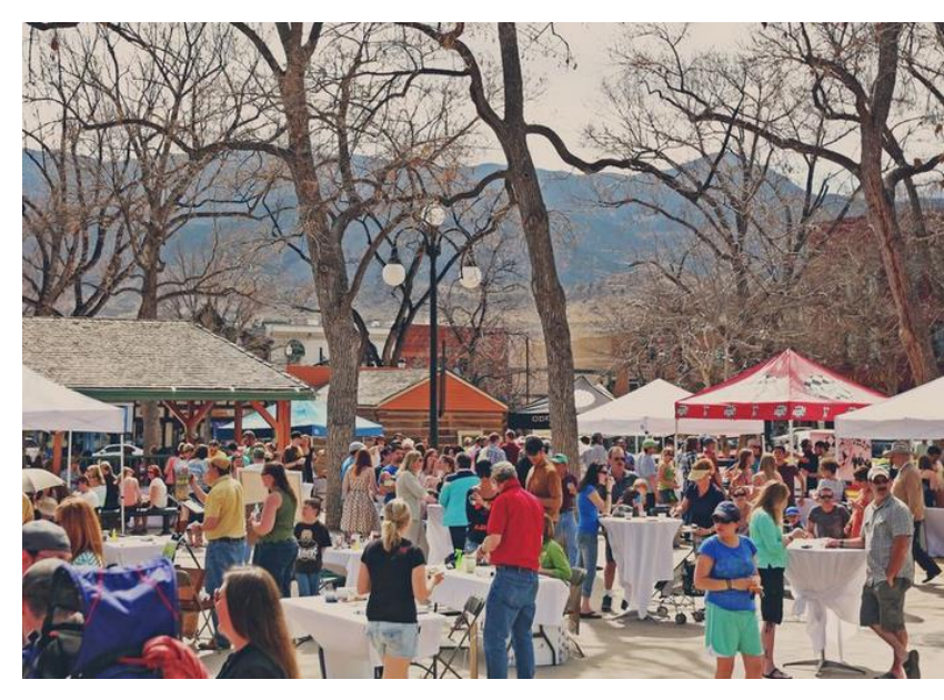
Taste of Old Colorado City