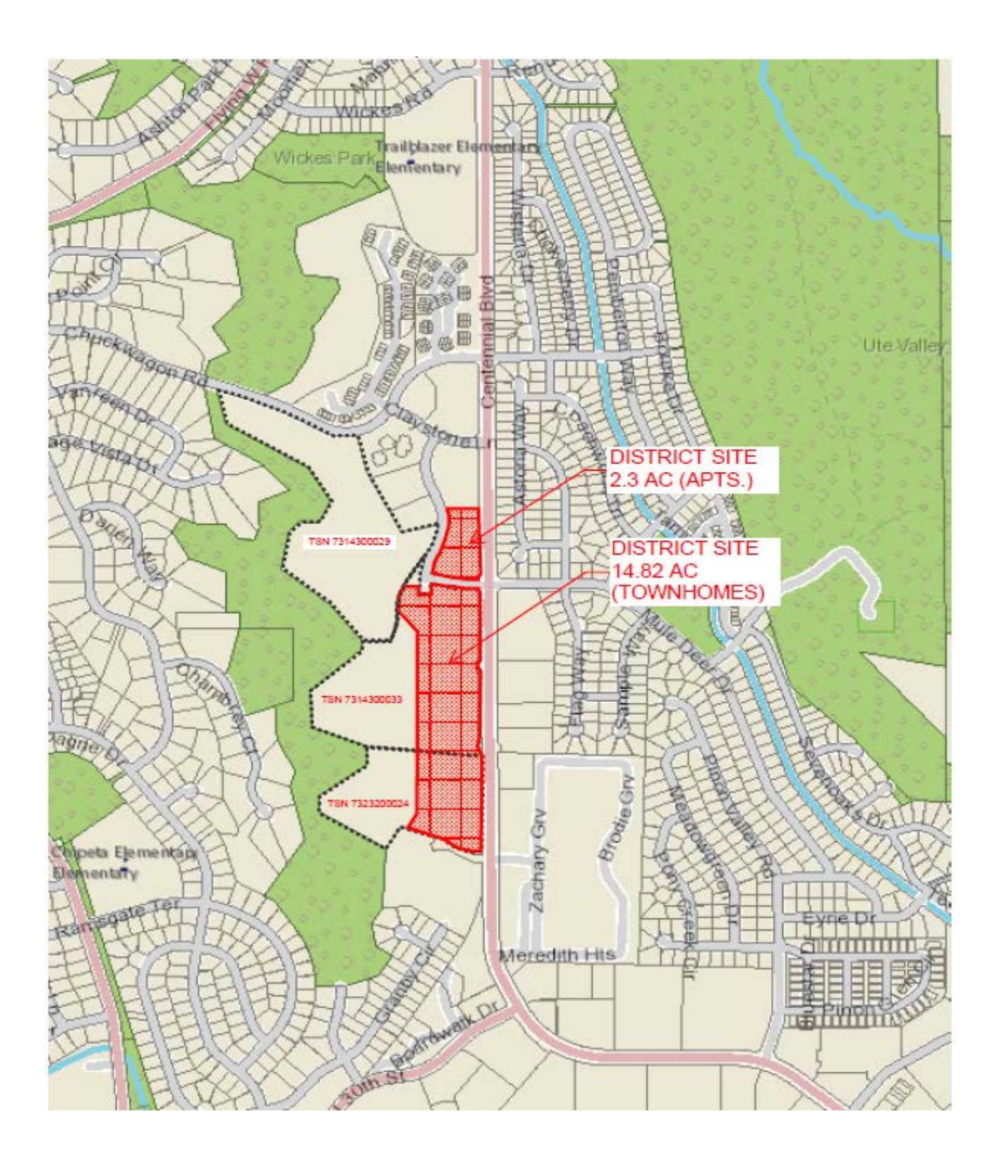
Boundary Map (Proposed Tuscan Foothills Village Metropolitan District)