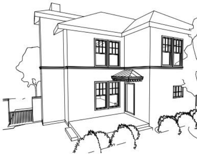
② PERSPECTIVE - EXISTING ENTRY

The applicant submitted a Report of Acceptability application for 1320 Wood Ave. Front Entry Covered Porch (see "Attachment 1 – Project Statement" and "Attachment 2 – Site Plan and Elevations").