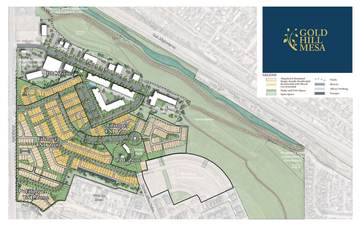
Figure 2. Gold Hill Mesa Concept Plan

The proposed project for the Plan Area, as expressed by the developer, is a traditional neighborhood development with a mix of uses in a walkable environment with streetscape, open space, parks, and trail connections, as shown in the concept plan illustrated in Figure 2 . The development includes approximately 550 residential units consisting of single family detached, townhome, and apartment units. The retail component includes approximately 70,000 square feet of space and will include a mix of restaurants and bars, general retail, and a grocery store. The project also includes a 100-key hotel.