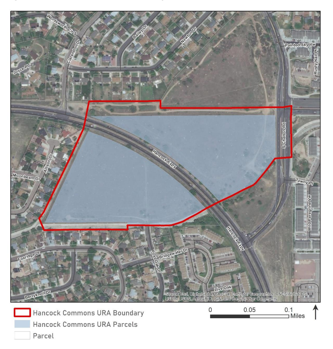
Figure 1. Hancock Commons URA Boundary

The Hancock Commons Urban Renewal Area ("URA" or "Plan Area") is located in the City of Colorado Springs in El Paso County. The Plan Area is comprised of one parcel, currently divided by Hancock Expressway, on approximately 18.59 acres of land and adjacent right of way. The boundaries of the Plan Area include a portion of Hancock Expressway that divides the parcel and Chelton Road to the east as illustrated in red below in Figure 1 .