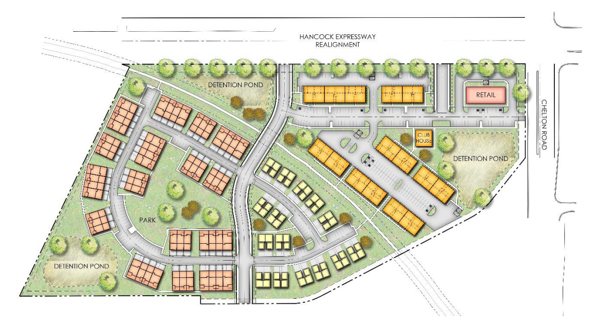
Figure 2. Hancock Commons Site Plan

Infrastructure improvements are a significant component of the development plan. Hancock Expressway will be re-routed and aligned along the north edge of the property. This realignment improves the street network and connectivity to the surrounding neighborhoods and will include an updated drainage system with a gravity sewer to serve the development on site.