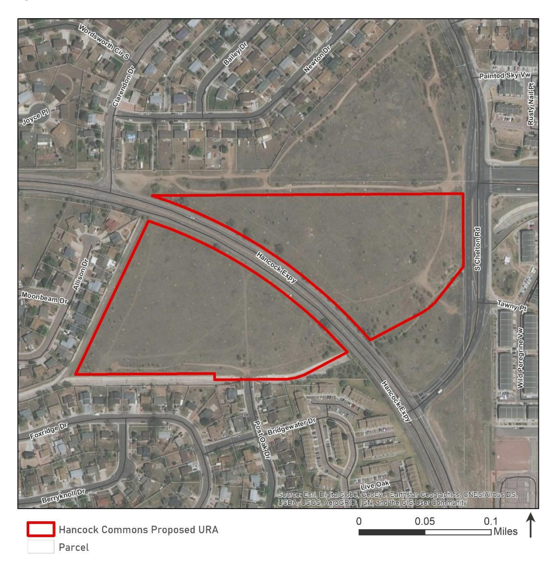
Figure 1. Hancock Commons Urban Renewal Plan Area