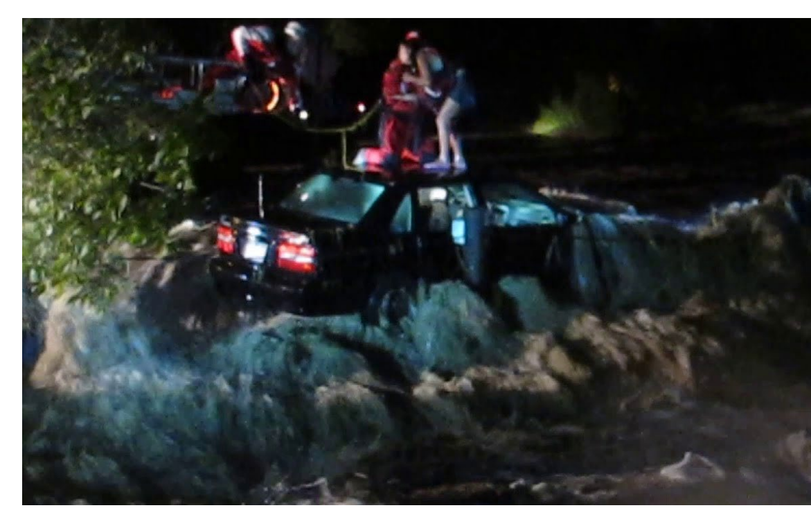
Emergency rescue during flood event at Sifred/Date