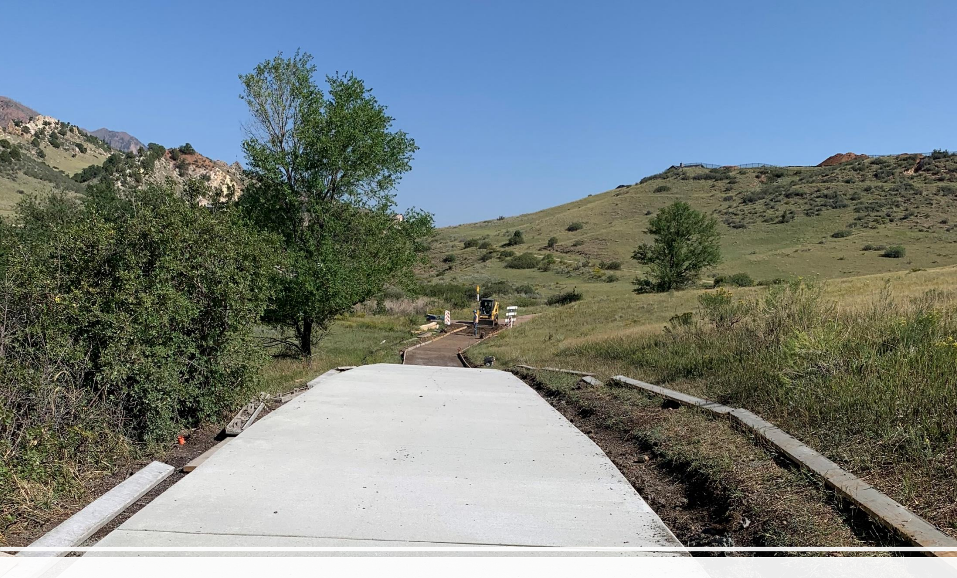
Palmer Mesa Trail-under construction