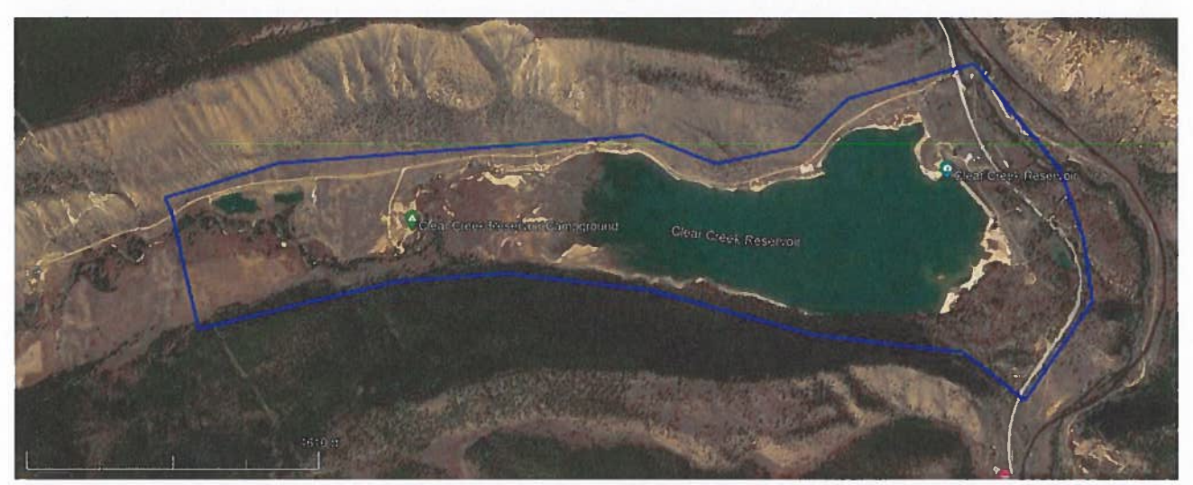
Figure 1: Proposed survey area (blue polygon) of the surrounding lake and lakebed elevation (bathymetry).

A feasibility study to assess the potential of raising Clear Creek Dam has requested River Science to provide elevation data for the reservoir's surrounding land. River Science and associates are experts in generating high accuracy and precision digital elevation models (DEMs) that often require bathymetric surveys. Working relationships with Red Rock Land Surveys Inc, provides professional land surveyor certified work when required. To complete this topographic survey, River Science will complete the following three tasks to survey the area of interest shown in Figure 1.