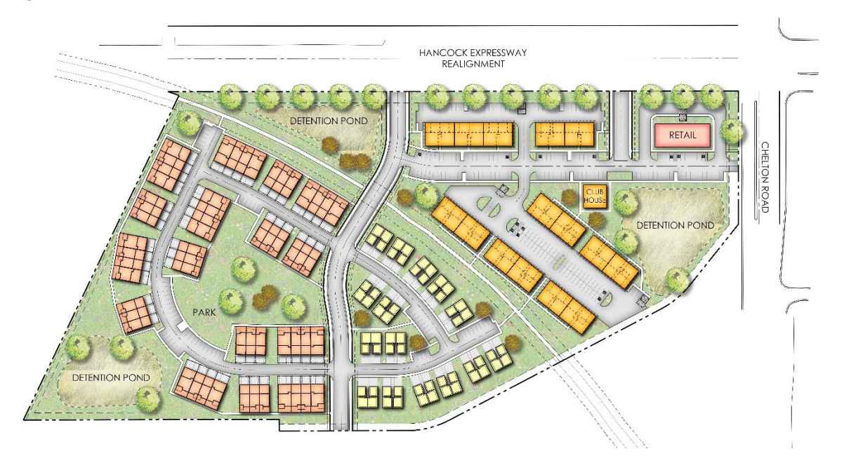
Figure 2. Hancock Commons Site Plan

Infrastructure improvements are a significant component of the development plan. Hancock Expressway will be re-routed and aligned along the north edge of the property. This realignment improves the street network and connectivity to the surrounding neighborhoods and will include an updated drainage system with a gravity sewer to serve the development on site.