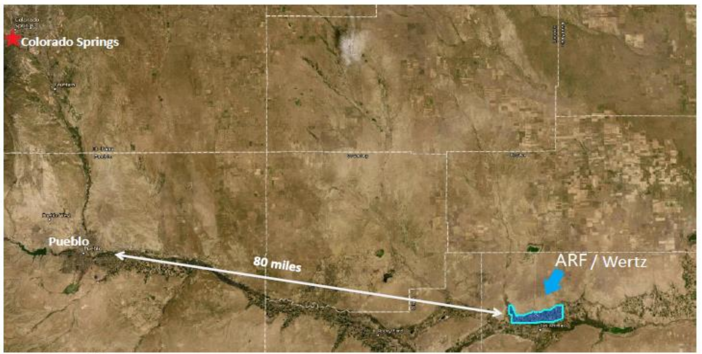
Colorado Springs Utilities