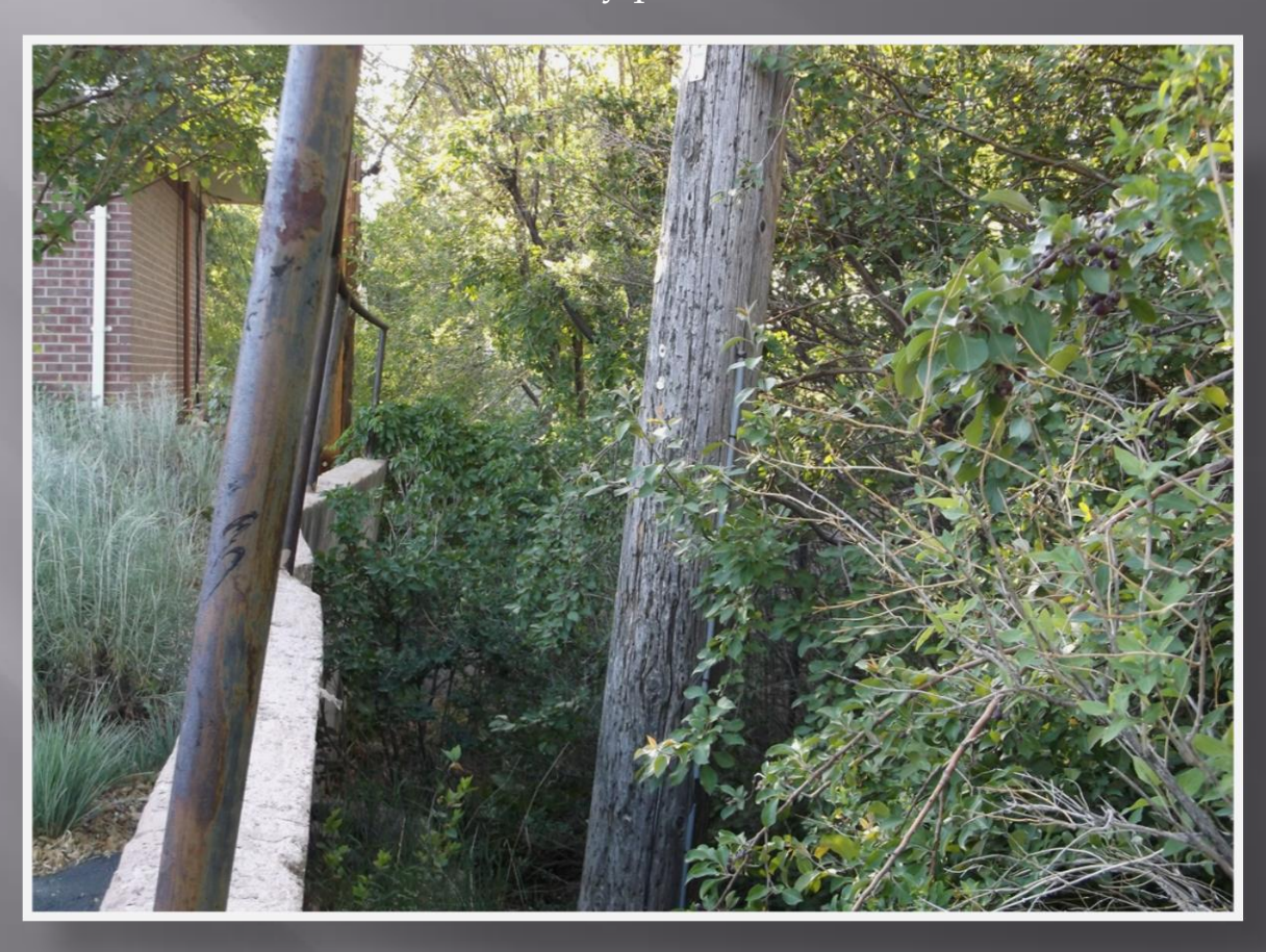
Southside utility easement, runs east/west. Southside Bldg. 619 on left, utility pole center