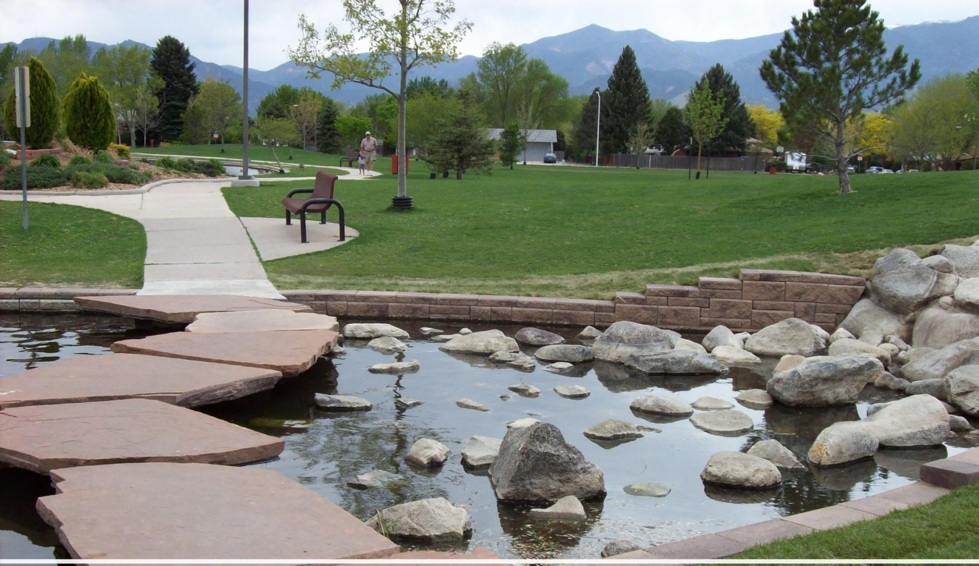
Nancy Lewis Park