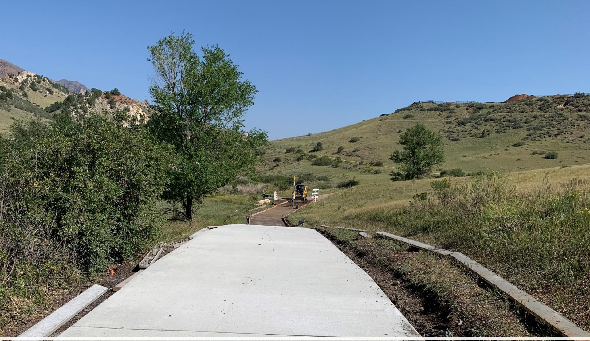
Palmer Mesa Trail-under construction