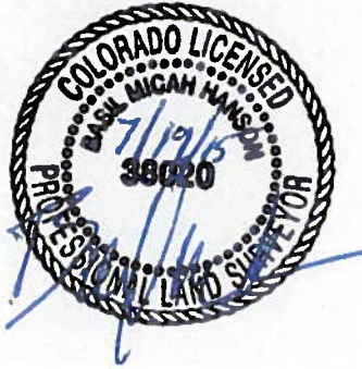
EXHIBIT B SKETCH is attached hereto and is only intended to depict Exhibit A – Legal Description. In the event that Exhibit A contains an ambiguity, Exhibit B may be used to solve said ambiguity.