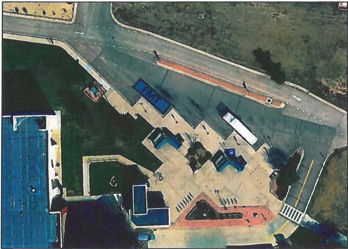
Figure 1: Pikes Peak State College Centennial Transfer Center

As of the effective date of this Intergovernmental Agreement, a designated transfer point for Fountain Municipal Transit (FMT) shall be the City of Colorado Springs' Pikes Peak State College Centennial Transfer Center, at the location shown in Figure 1 in bus bay designated as "FMT". Use of this location and bus bay is non-exclusive and expressly subject to the needs of Mountain Metropolitan Transit. This location may be terminated, or a new replacement transfer point may be designated, by the City of Colorado Springs Transit Division Manager at any time, in accordance with paragraph 7 of the Intergovernmental Agreement.