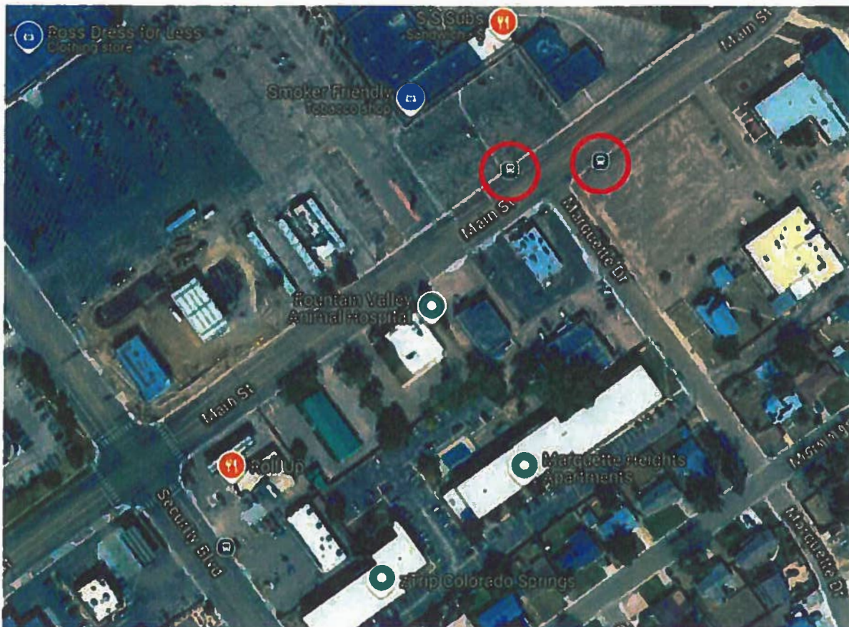
Figure 2: Main St and Marquette Dr. Bus Stops

As of the effective date of this Intergovernmental Agreement, designated transfer points for Fountain Municipal Transit (FMT) shall be the two bus stops located at Main St. and Marquette Dr. identified by the red circles in Figure 2. Use of this location is non-exclusive and expressly subject to the needs of Mountain Metropolitan Transit. This location may be terminated, or a new replacement transfer point may be designated, by the City of Colorado Springs Transit Division Manager at any time, in accordance with paragraph 7 of the Intergovernmental Agreement.