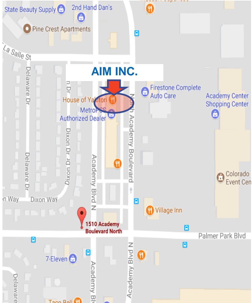
1624 North Academy