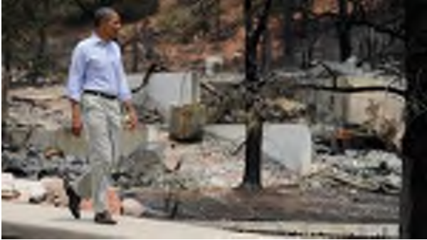
President Obama inspecting the aftermath of Waldo Canyon fire 2012