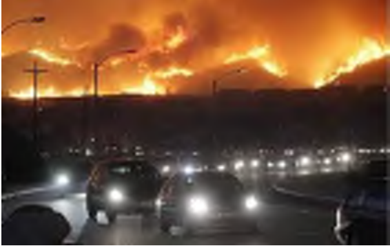
Waldo Canyon June 2012 Fox 21 News

Possible intro for article. City planner worried that SHE wouldn't escape a grass fire. But the planning commissioners are OK with adding over a thousand people where an entire neighborhood barely escaped the Waldo Canyon inferno (and where two people didn't).