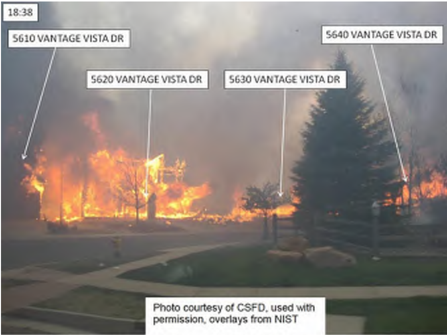
Figure 38 Image showing structure to structure fire spread on primary structures ignited by 18:38.