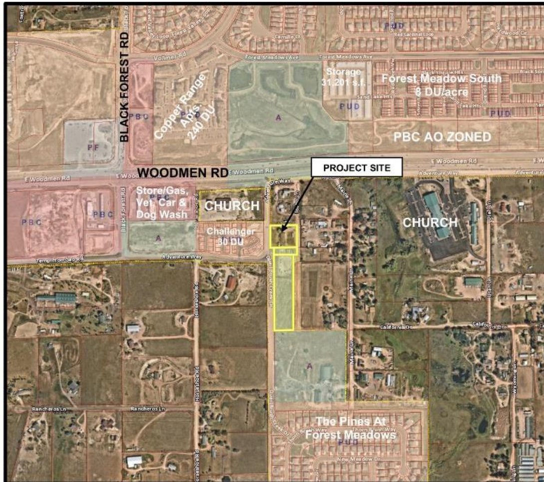
THE PASTEL-COLORED, SHADED AREAS ARE CITY OF COLORADO SPRINGS. THE UNSHADED, AREAS ARE UNINCORPORATED EL PASO COUNTY.