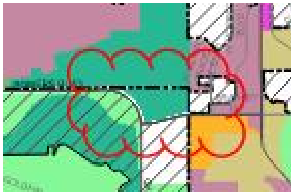
Potential Annexation Areas (See Annexation Plan for Status) Existing Park Land or Open Space