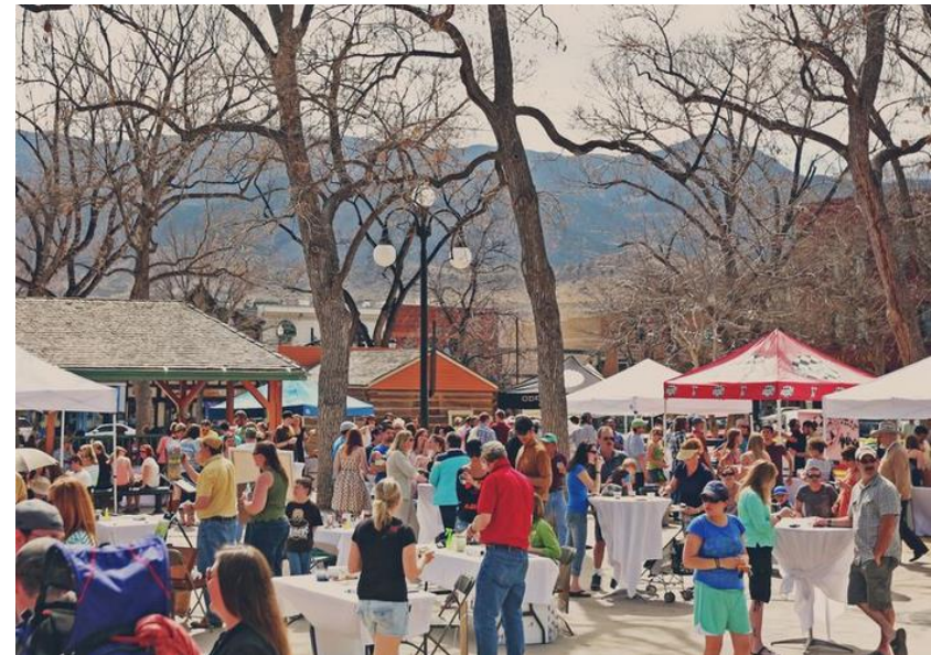
Taste of Old Colorado City