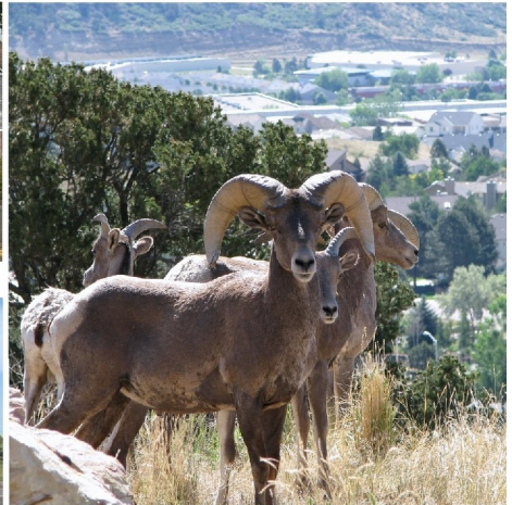
Iconic Wildlife that could be threatened