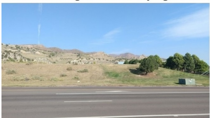
Looking west across 30th Street just south of 2424 Garden of the Gods Rd.