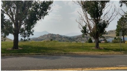
Looking south on Flying W. Ranch Rd. just north of 30th Street.

Before images & artist renderings as implied in the developer's Concept Plan.