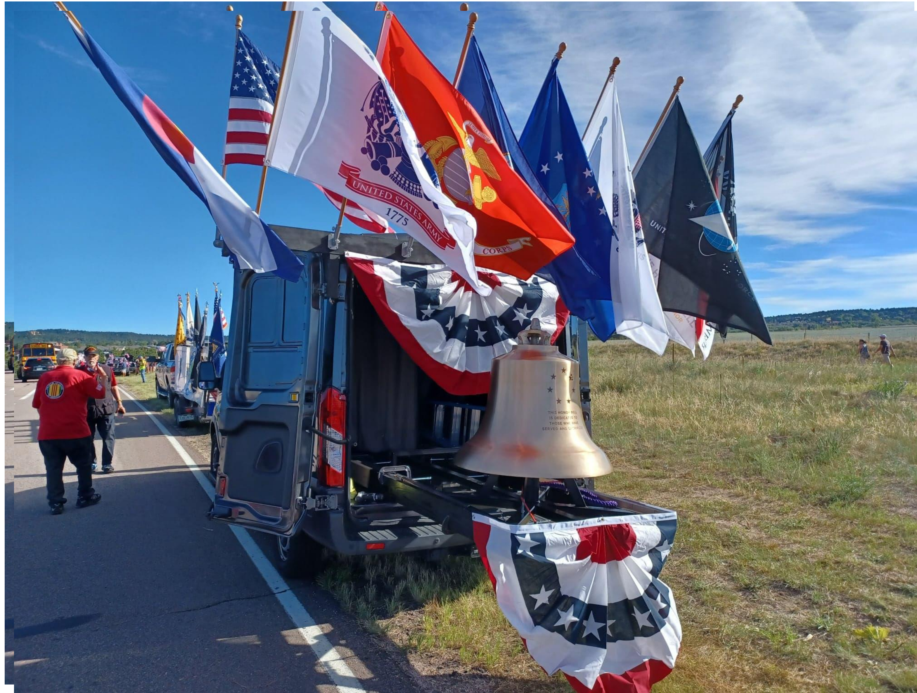
Parade Configuration FORGED FROM HONOR