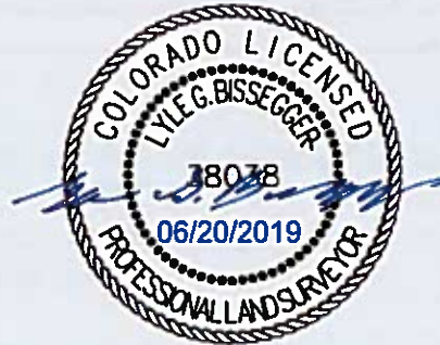
EXHIBIT B is attached hereto and is only intended to depict EXHIBIT A - Legal Description. In the event that EXHIBIT A contains an ambiguity, EXHIBIT B may be used to resolve said ambiguity.

Prepared for and on behalf of Galloway by Lyle G. Bissegger, PLS# 38038